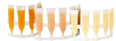
FOSFACELL PLUS, E-TONIC, FOSFASLIM PLUS

RIVILIFT, ELISIR PLUS, LIFTING MASK & BRILLIANT MASK